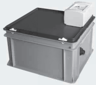
Neutralizer mm 480 x 300 x H 320